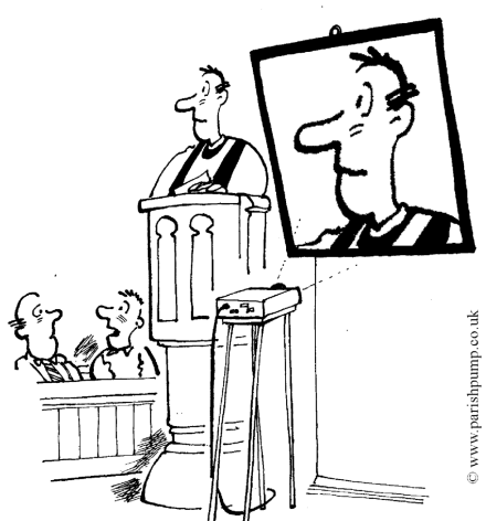
... to be honest, I am not sure that all the money spent on a data projector was money well spent!